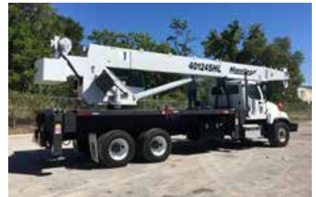
Manitex 40124SHL: 40 Ton Capacity, 123.5' of Main Boom