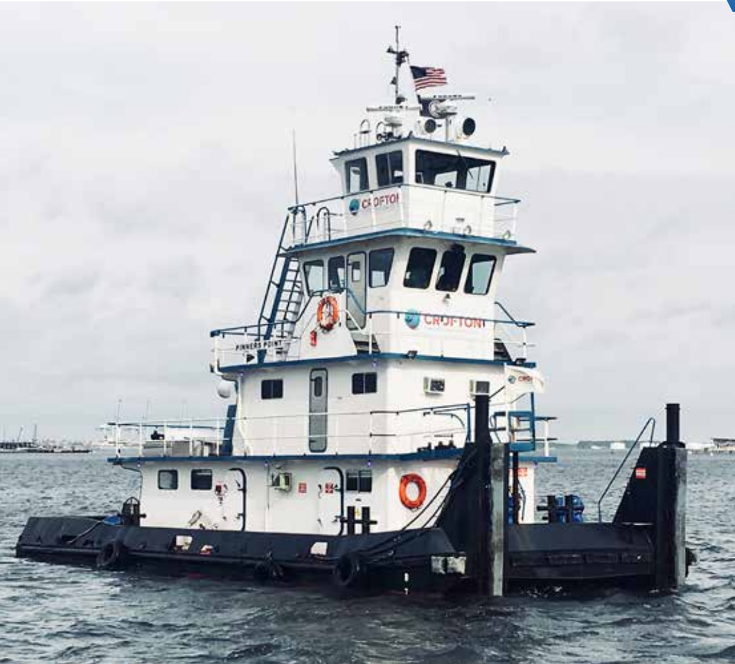
Pinners Point: 1400 HP, Twin 12V92 Detroit, 55.4' Length, 22' Beam, 8.3' Draft, and Upper Pilot House Station.