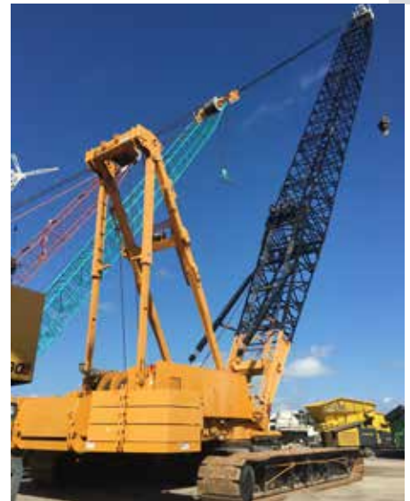
Manitowoc 2250: 300 Ton Capacity, 240' of Main Boom